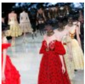
Honeycomb, Bees at Apiary-Themed McQueen Show