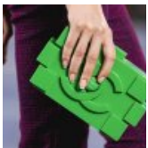
Zoom Shot: Chanel's Lego Block Clutch